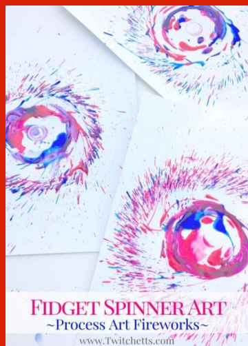
FIDGET SPINNER ART ~Process Art Fireworks~ www.Twitchetts.com