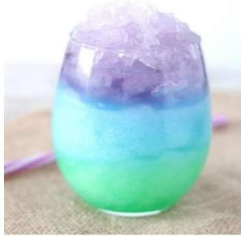
MERMAID LAYERED SLUSHIES