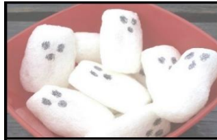
Vanishing Ghosts simple STEM for Halloween